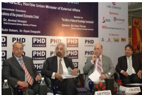
Mr. Pitroda at PHD Chambers of Commerce and Industry