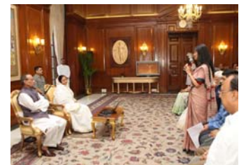
Launch of the Teachers Portal at Rashtrapati Bhawan

Visit the portal at http://teachersofindia.org/